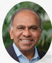
Subra Suresh Nanyang Technological University (Singapore)