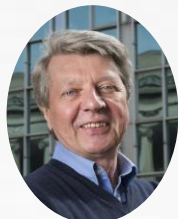
Krzysztof Matyjaszewski Carnegie Mellon University (USA)